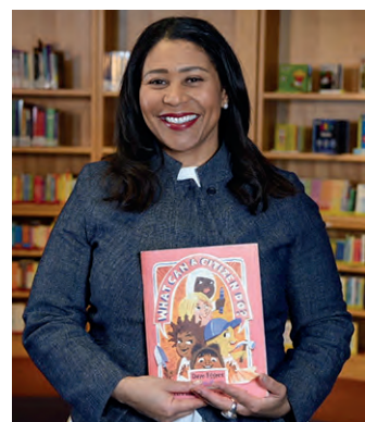
Special thanks to Mayor Breed for reading one of our first Sweet Stories.

We love supporting the early learning of your children and encourage families to talk, read, sing, play and write, every day.