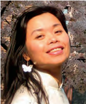
Nguyen Phan Que Mai

Join the Library for an exciting book club discussion of The Mountains Sing , Thursday, May 21, 7 p.m. Reservations required: https://bit.ly/MntSingReg